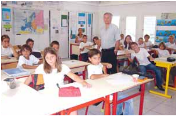
Senator Michel Magras with a CM1 class from the Ecole Sainte-Marie in Colombier and CM2 from Gustavia.

The 20th edition of "Press Week In The Schools" took place from March 23-28. The goal of this week: to teach students about the role of media. As part of the project, the newspaper for children, Mon Quotidien , and the French Senate organized a national competition for the best class